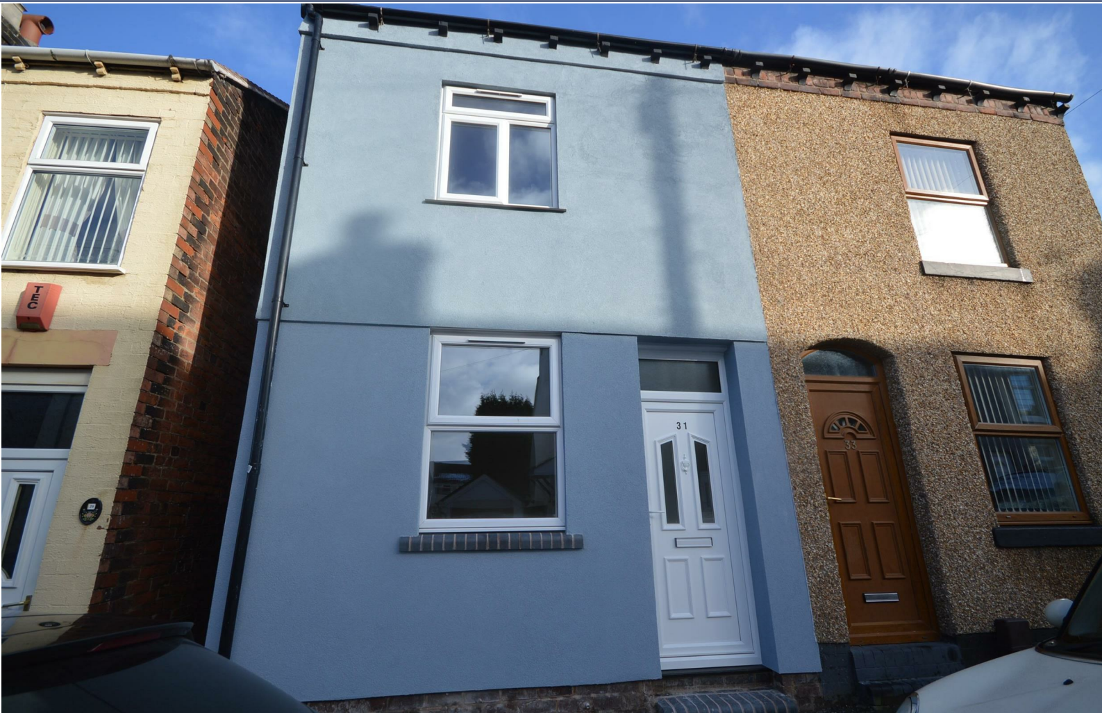
Skellern Street Talke